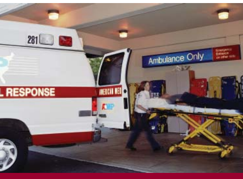
Medics Ambulance Service handles over 40,000 calls a year in South Florida using RescueNet Billing and RescueNet Dispatch.

The Billing Today screen can be tailored to alert each user to the areas they want to monitor, such as no activity on primary payer in first 30 days